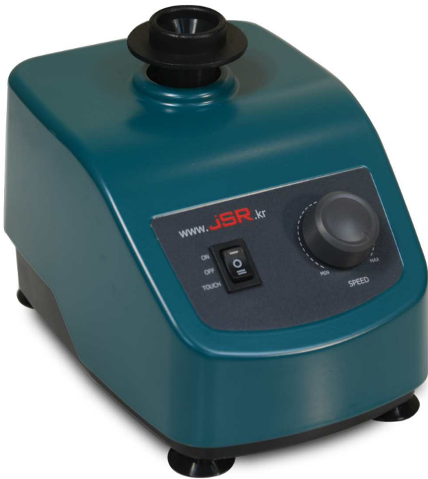
Pop-Off Cup Head