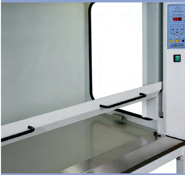
Safehood 120 detail