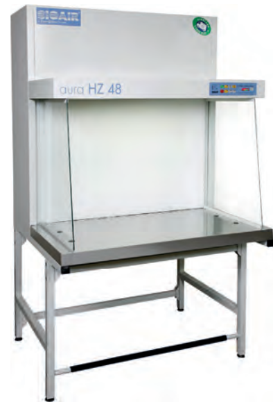
⊕ Lateral Flow Concept side walls