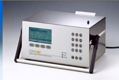
Particle Counter LAP340