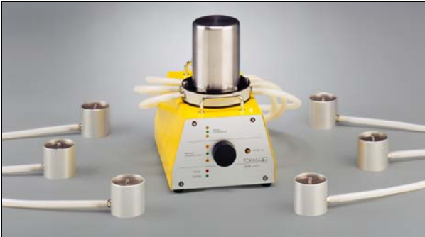
Aerosol Distribution and Dilution System ADD 536

Hospital operating rooms are specially designed to avoid contaminations and therefore additional infections of patients during operations. To assure a low level of particle contaminations a laminar air flow is applied to the operating table. To verify the retention efficiency of this flow regime a verification with a defined test aerosol is required according to the standards DIN 1946-4 and SWKI 99-3. For that reason a total particle rate of 6.3 \cdot 10^7 P/min has to be distributed to six different positions and emitted with a reliable long term stability. From the standards it is also required that this total particle rate is continuously monitored and controlled by a particle counter. The Topas Aerosol Distribution and Dilution system ADD 536 meets all these required demands for providing a defined test aerosol with the following features: