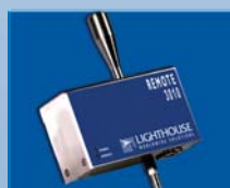
Stainless Steel Enclosure