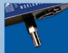
Barbed Vacuum Connector