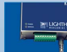
Screw Terminal Connector