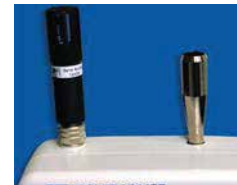
Removable Temp / RH and Isokinetic Probes