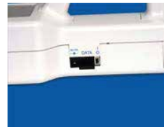
Easily Download Data to PC