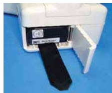
Removable Rechargeable Li-Ion Battery