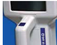
One-handed Operation with Start & Stop on Handle